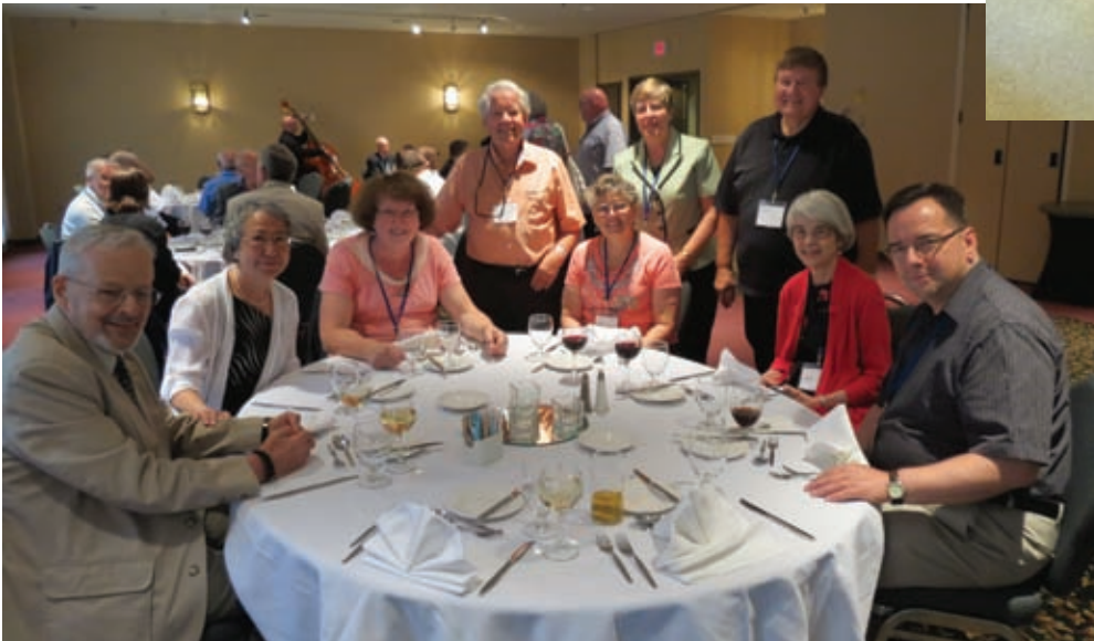
The Ottawa contingent enjoying good food, friendship and stringed music at the closing banquet in St. John's